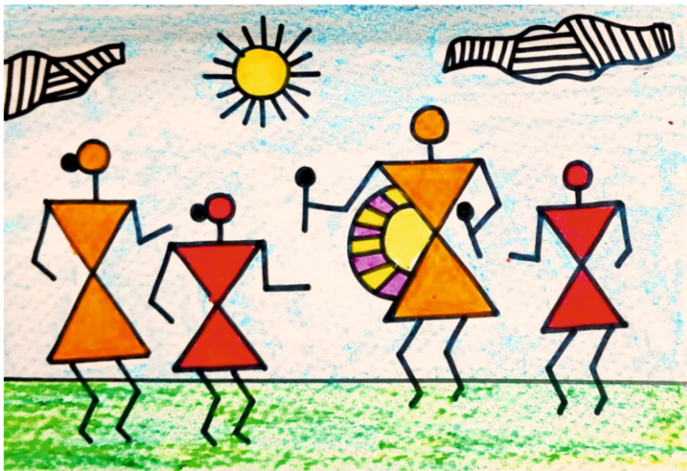
Basic Warli art.

Some examples for reference to questions above :